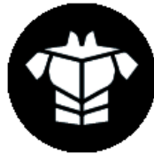
See Through Armour