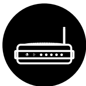
GPS Anti Jam Device