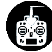
Remotely Piloted Airborne Vehicles