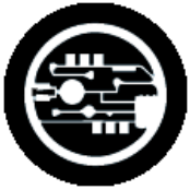
Development of 4G/LTE based Tactical Local Area Network