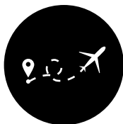
Data Analytics for Air Trajectory