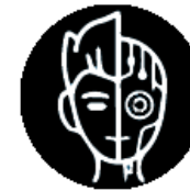
Secure hardware based offline Encryptor Device for Graded Security