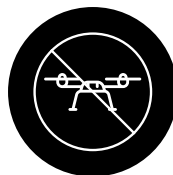
Illegal usage of Drones