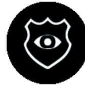
Active Protection System (APS)