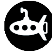
Unmanned Surface and Underwater Vehicles