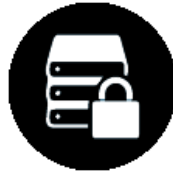
Artificial Intelligence in Logistics & SCM