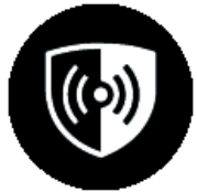
Individual Protection System with built-in sensors