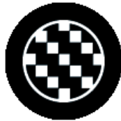
Carbon Fibre Winding (CFW)