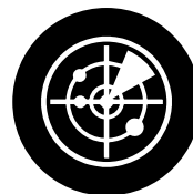
RADAR - IQ Signal Generator